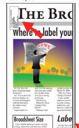
Final fold as presented to Post Office