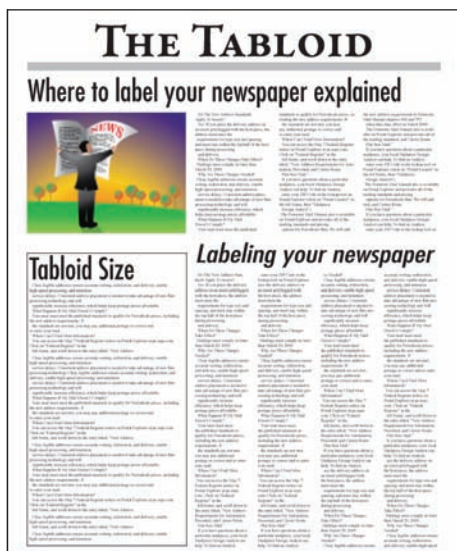
Label Option 1 for Tabloid Presented Flat