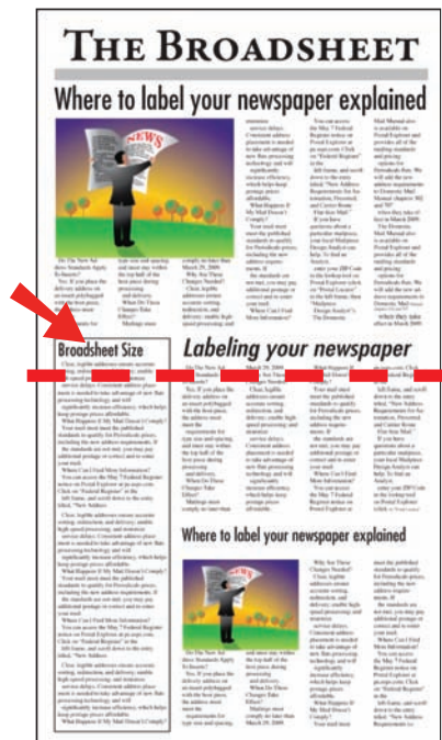
Label Option 1