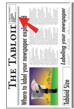
Final fold as presented to Post Office