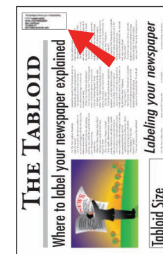
Final fold as presented to Post Office