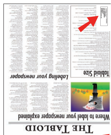
Final fold as presented to Post Office