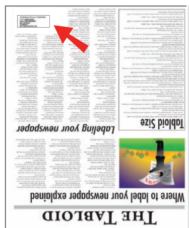
Final fold as presented to Post Office