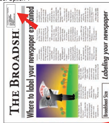
Final fold as presented to Post Office