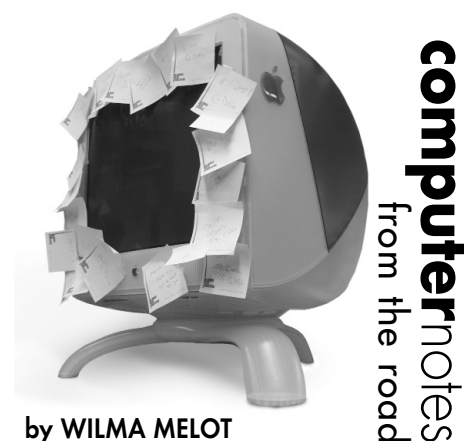
by WILMA MELOT

First of all, re-download the PDF. I always suspect a corrupt download when files don't work. Besides, it's one of the easiest things to try and if it works – great. I recommend downloading it in another Web browser than the one you originally used. For instance, if you used Internet Explorer, re-download the file using Netscape. For those of you using OSX or Windows, Firefox and Opera are good alternative Web browsers. Having lots of programs in your arsenal is always a good thing.